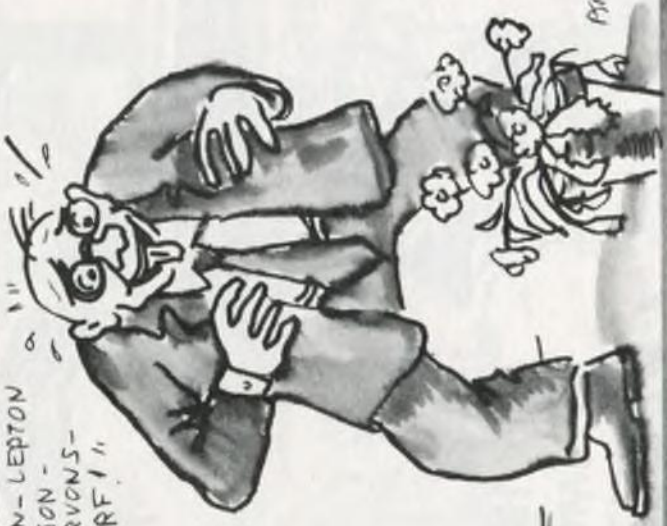
THE SCIENTIFIC "INDUCTIVE" METHOD